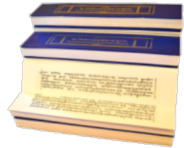
Bodong Panchen SungBum (Volume 1-111)