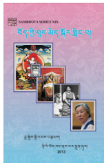
Tibetan Women (Sambhota XIX)

Tibet House regularly publishes books, booklets and pamphlets on a variety of topics related to religion, philosophy, Tibetan history and culture, inter-religious tolerance and ecological responsibility.